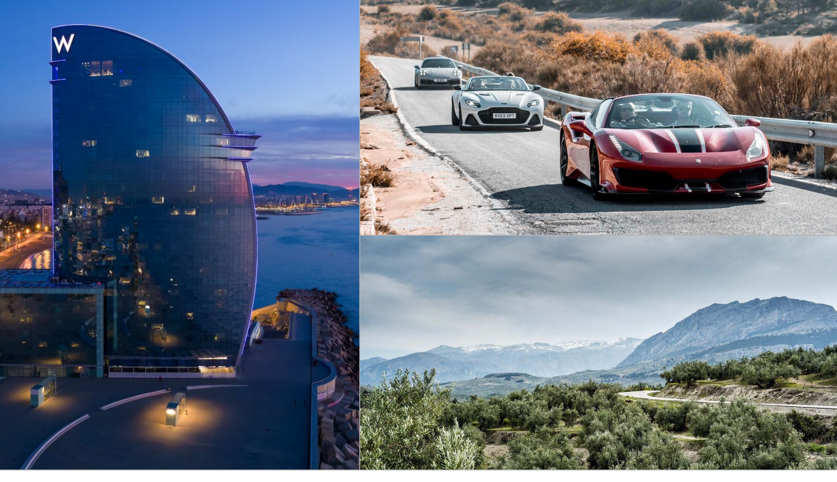
Saturday 28th June