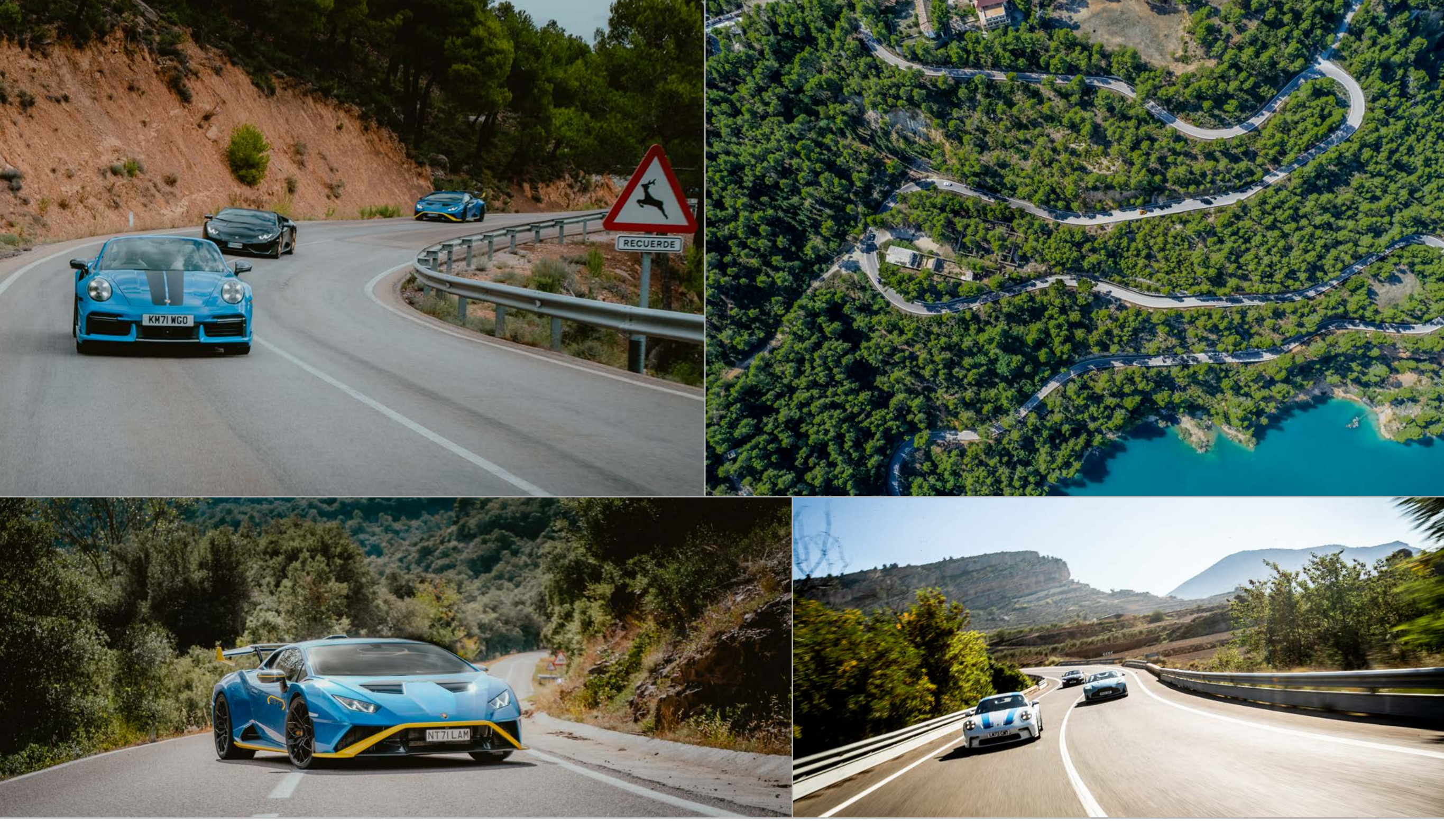
Thursday 26th June