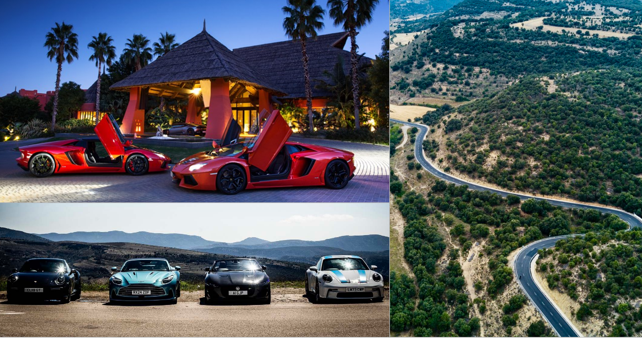
Tuesday 24th June