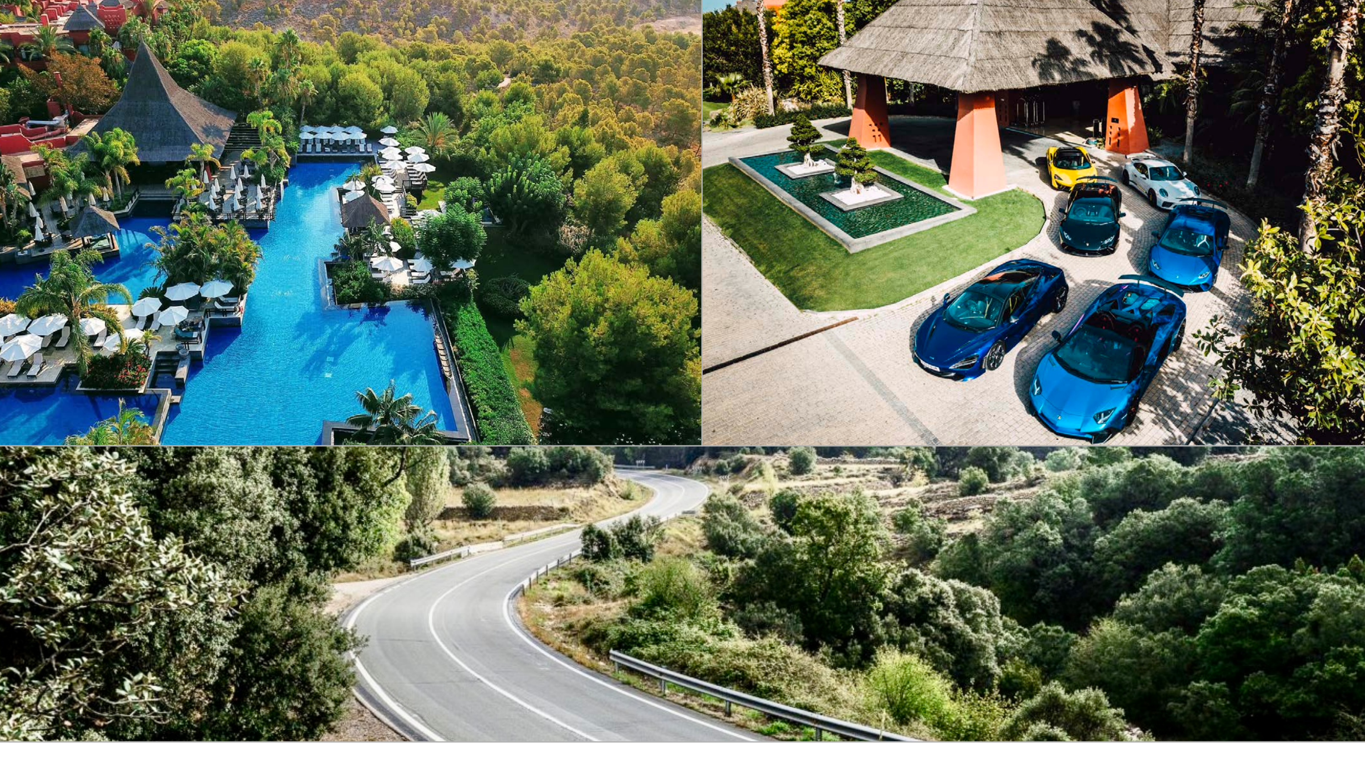
Wednesday 25th September