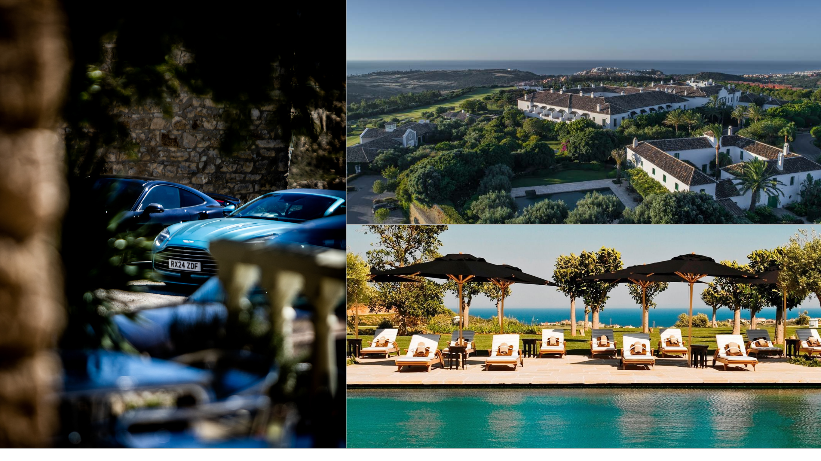
Sunday 22<sup>nd</sup> June