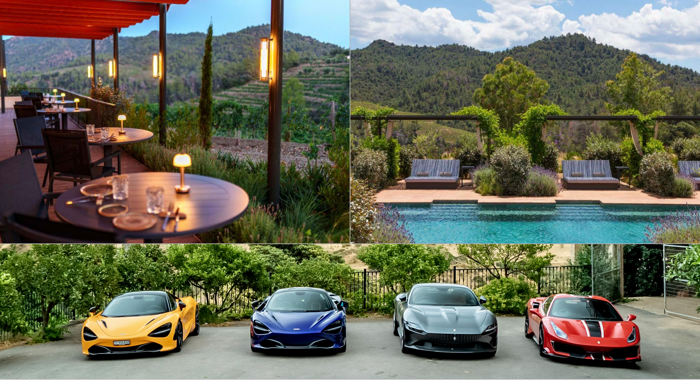
Friday 27th June